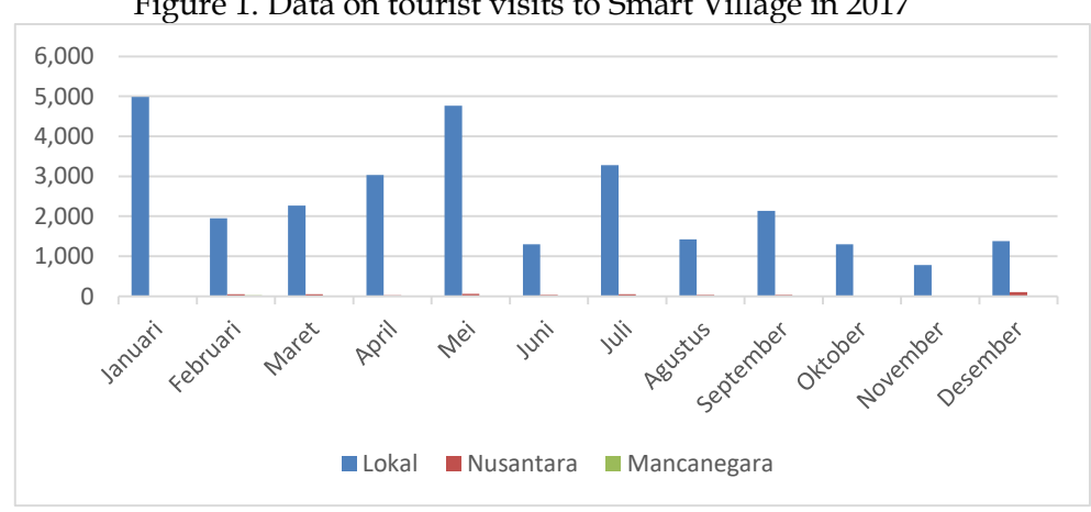
Figure 1. Data on tourist visits to Smart Village in 2017

The problems were continued and compounded by the earthquake in Lombok in 2018. That made Sesaot suffered a significant loss of international and national visitors. The Lombok tourism industry felt the impact of the 2018 earthquake until 2019. Starting 2020 with hope and wish to be better for Lombok, but Covid-19 pandemic came and made all the industry shut down. However, still, Sesaot has the potency and experience to face the big low season. The Attraction of the Sesaot Rural Tourism Area can be used as a determinant factor to attract the tourist to visit the destination. Sulistyan, Ariyono, and Taufiq (2019) stated that Attraction is one factor that influences the tourist interest in revisiting a tourism destination. Koda and Nurlette (2018), Diniyah and Khoirullah (2018), and Marpaung (2019) agreed with Sulistyan, Ariyono, and Taufiq (2019).